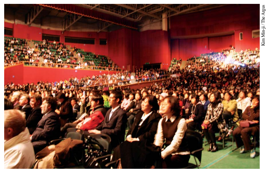
The professors, students, and their parents are enjoying the festival.

welcome meeting was held for the freshmen of HUFS and their parents to congratulate the students in entering HUFS on February 18. Freshmen of both Seoul and Yongin campuses filled the Olympic Hall in Olympic park.