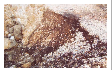
The illegally reclaimed land contaminated by the scrapped material

There are traces from machines pushing scrapped material to the sea. The sea water reaches the scrapped material when the tide