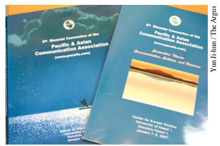
A book informing about the convention

Pacific and Asian Communication Association (PACA) held its 6th biennial convention at the Center for Korean Studies at the University of Hawaii, spanning from January 7 to 9. Communication specialists in the Pacific and Asian regions gathered to discuss and ponder the real meaning of globalization.