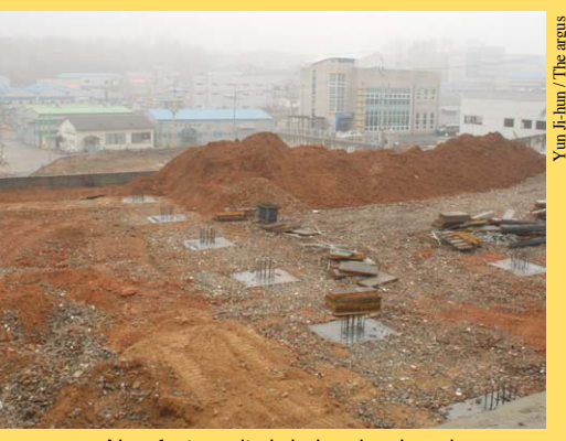
New factory site is being developed.

There are a few reasons for reckless development: local governments' exceeded