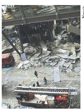
ETA attacked subway station in Madarid on February, 2007.

more important than any other things. Canadian government is frightened about Quebec's independence, because their efforts resulted in success soon. After the riot, Quebec could choose violent actions, but they did not. In fact, French in Quebec could break the war between Canada and Quebec using the French power. Their realistic view made Quebec to be a country, not taking the violent action. Basque could choose a realistic plan. In order to lead to the economic growth, they can develop the tourist industry and steel industry. However, ETA takes the violent line and thus, Quebec's economy suffered from 9 billions euro losses last year. Violence results in another violence. ETA's attitude made possibility