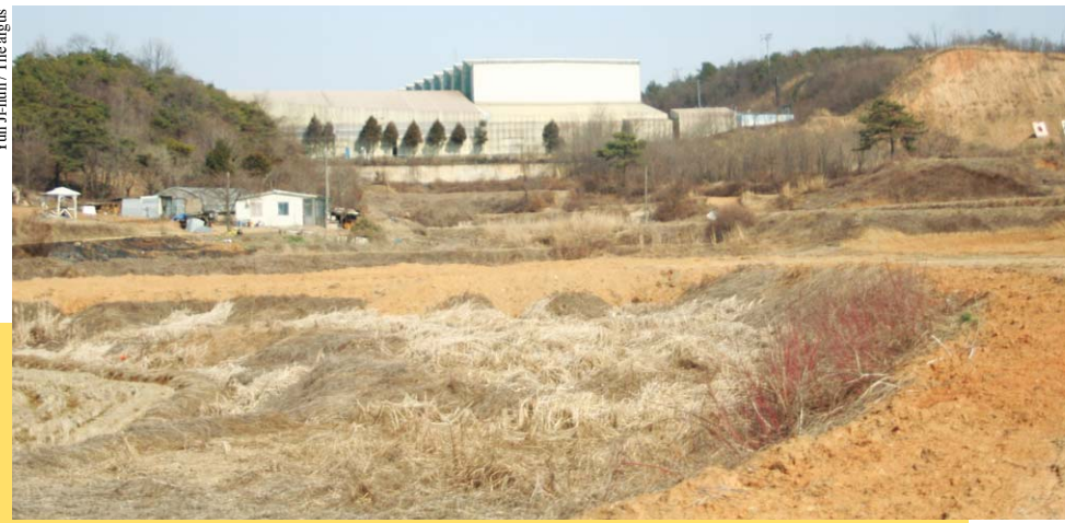
An auto parts factory is standing beside rice fields and a house.

Firstly, a developer expediently draws up or fakes the evaluation sheet. One divides development areas into many parts. Then, using others' names one illegally registers for respective development to every part in order not to meet the conditions for letting the assessment fulfilled. For instance, if developers are willing to construct roads, they should make environmental impact assessment of every road above the length of four kilometers. Supposed to build a road at 10 kilometers, one divides the road into four parts, three, three, two and two kilometers (Connection Development). One registers for first part development using one's name, and for the other parts using others' names. Developers can slip from the grip of the law in this and another way. As a result, although different names are put down in developer register forms, only one absolutely earns a substantial profit. Besides, a lack of the whole assessment can exert a bad influence upon the environment.