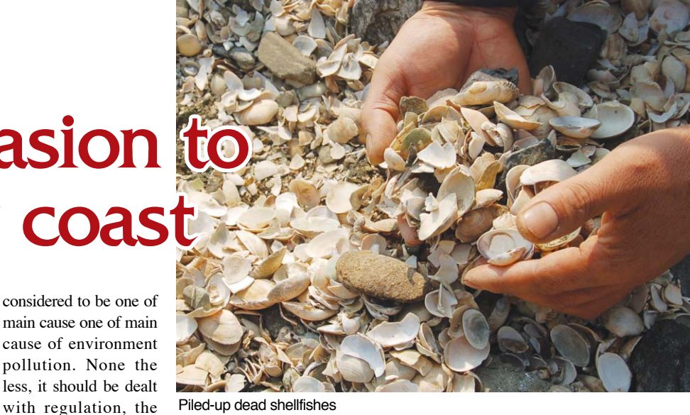
Piled-up dead shellfishes

ince 1997, the one shipyard located in Boryung has been gradually making illegal reclaimed land. The size of that land is about 15 thousand pyeong, a unit of area. The shipyard has dumped its waste without processing the sewage in disposal facilities, which ruined environment. It also damages the life of the local residents. because it would not utilize the safety facilities for protection against dust. The residents who cannot bear have demanded Boryeong to restore the original state several times. Boryeong, however, have turned off listening to demands.