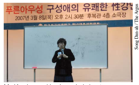
Ms.Koo is speaking her mind about sex.

Because lectures were going on students'