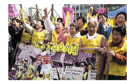
On March 13, "Comfort womens" hold the 500th Wednesday demonstration in front of the Japanese Embassy.

O n Wednesday March 13, a group of "comfort women" staged their 500th demonstration in front of the Japanese Embassy started in 1992 on the occasion of