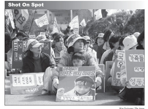
On March 11, power plants' labor union held a rally at Chongmyo Park in front of Seun Market. Thousands of labors and their families were gathered. They said, "We object to selling off power plants to foreign companies."