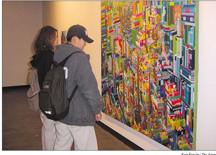
Spectators are viewing pictures displayed in Insa Art Space, one of Alternative Spaces, on March 31st.

"In the Loop" is the first Alternative Space in Korea and has the advantage of local position around Hongik University, the youth's street. The "Loop" pursues communication with the general public in addition to finding promising young artists.