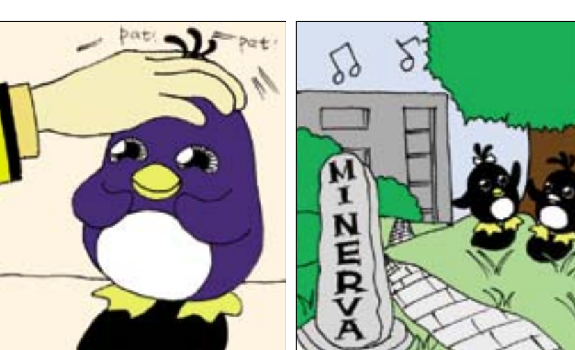
Minerva is our rest area.