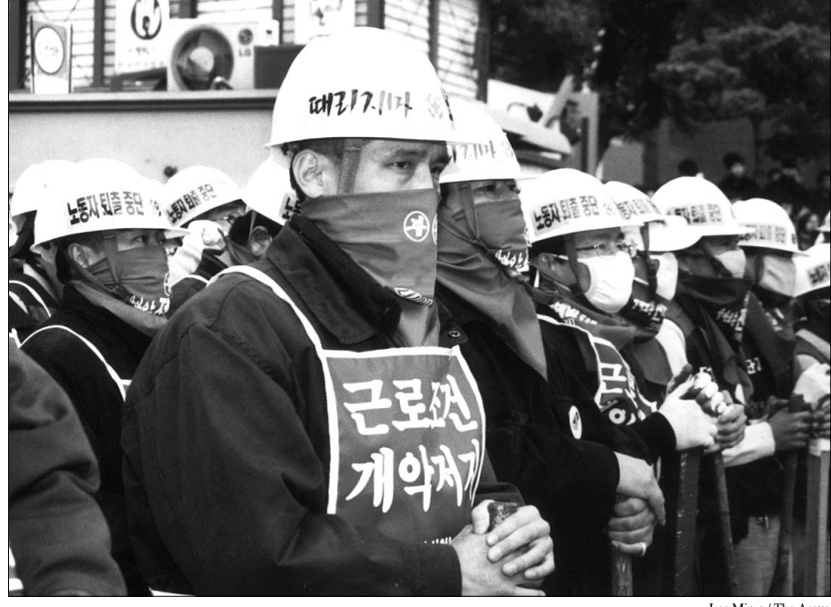
Irregular workers are calling for the improvement of working condition.

II. Revision to hinder labor movement The company claims that flexibility of