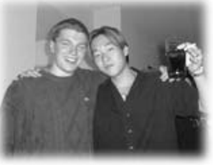
The writer on the right

undisputed attention to the quantitative reasoning of the business world. Again, such environment makes Stern all the more challenging.