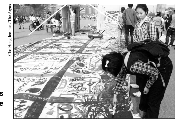
"Let's paint this Kyungui line together."