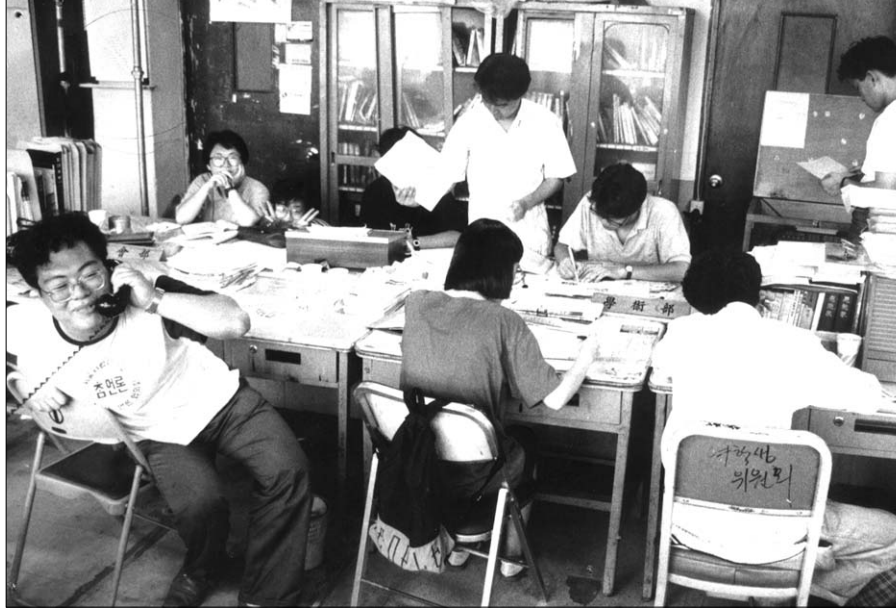
Reporters of HUFS Weekly are working at their office.

In this age of internationalism and globalism, there should be more interest