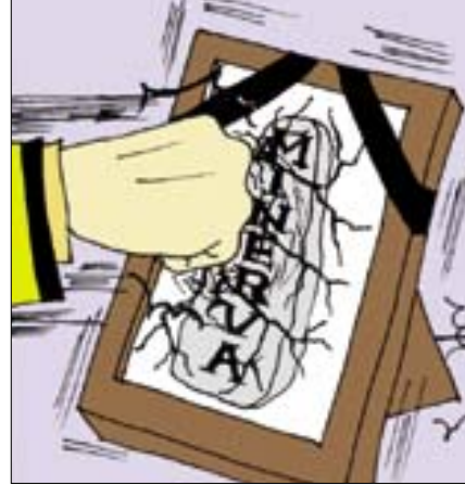
who made our Minerva like this?