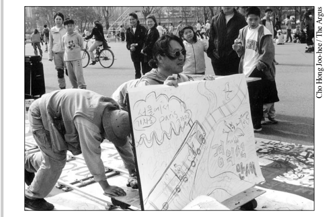
"From Seoul to Paris by Kyungui Railroad!"