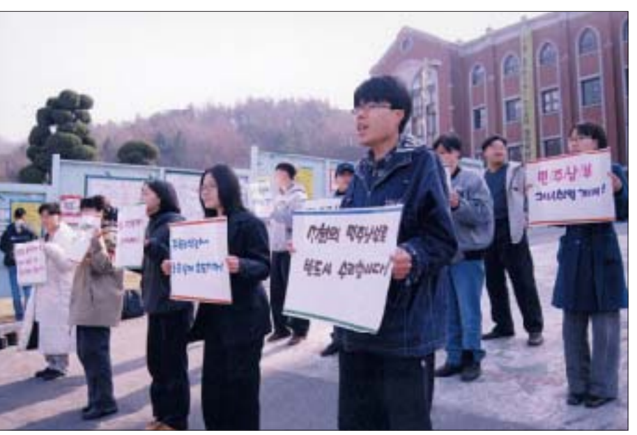
The officials of GSC appealing to the students to participate Democratic payment in the morning.

Many students, however, has worried to participate in this campaign because there were any legal safety. Especially, they feared