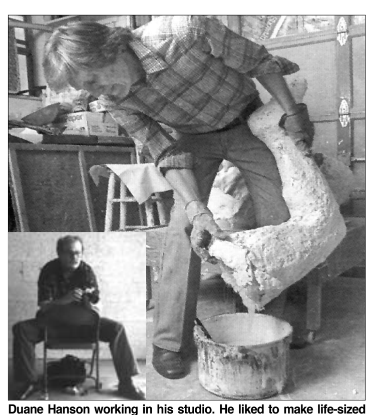
pieces crafted in polyester and fiberglass.