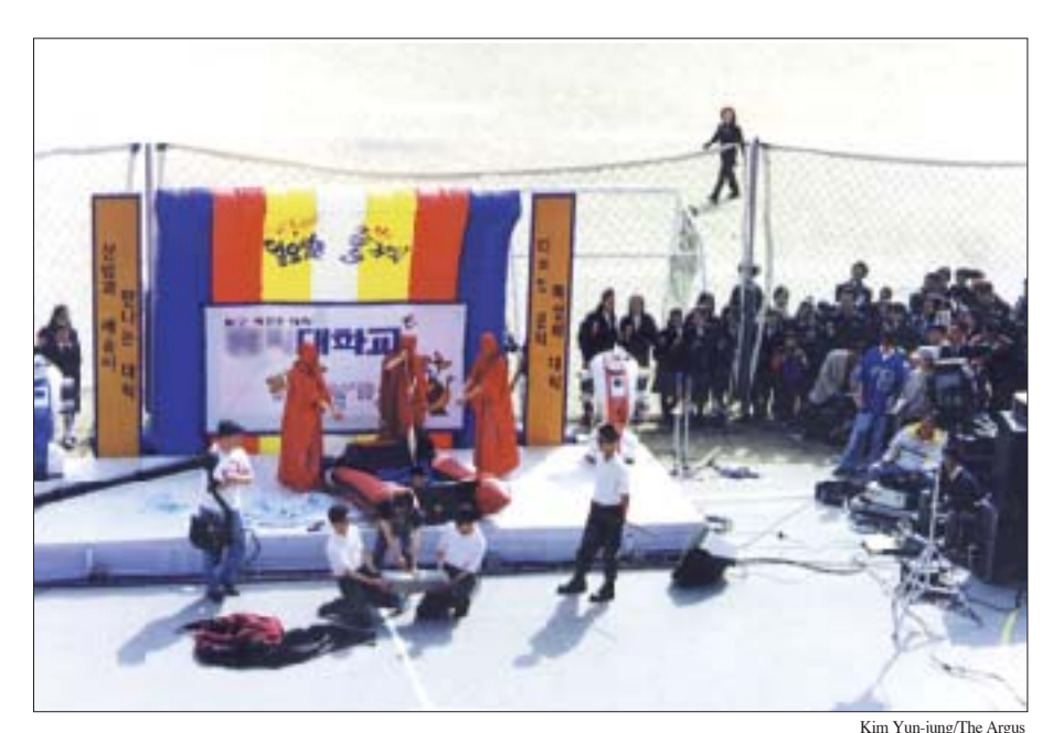
Students performing in 'Campus Image Song' of KBS.

Survival Meeting's format male students and female students meeting through a game. Of course, someone says these are not the contents of programs but student's quality. But their flash dance and excessive gesture appreciated for their university public, university music video with captions like 'performance decision' or 'specific performance decision'. In this way, TV viewers could see converted same specialty