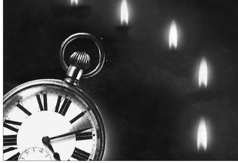
In the face of the forthcoming millennium, people should celebrate the birth of a new era instead of getting frightened at the end of the passing millennium.

When it comes to space, he says, mentioning time is inevitable. He tells that the length of time has been shortened gradually by the discovery of geography and revolutional changes of transportation. Due to the relative concept of time, our comprehension about space has changed, namely we take the earth to be much more smaller than that of a few centuries ago.