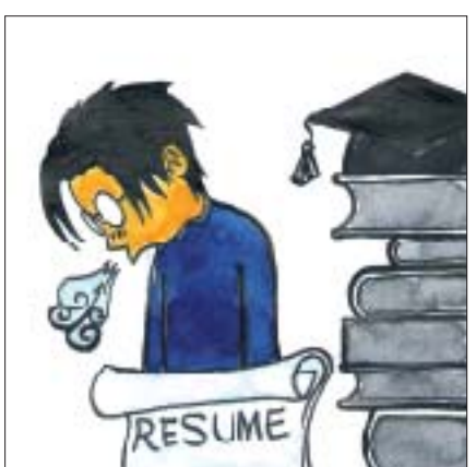
"High graduated, without job"

Bang\ Sung-hoon\slash\!\!/ Cartoonist\ of\ The\ Argus