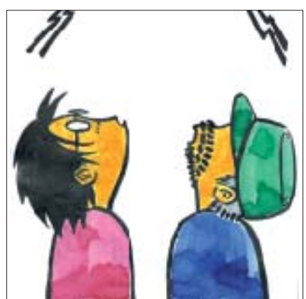
"No vote, Penalty ₩5000!"