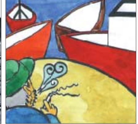
'Afer Korea-Japan agreement of fishery'