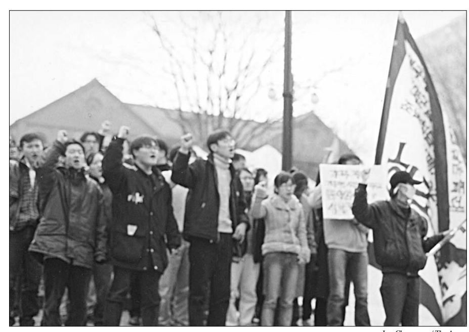
Hanchongnyon students shouting 'Withdrawl of Kim Dae-jung regime' in front of Myungdong catholic cathedral.