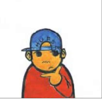
"How should we live?"