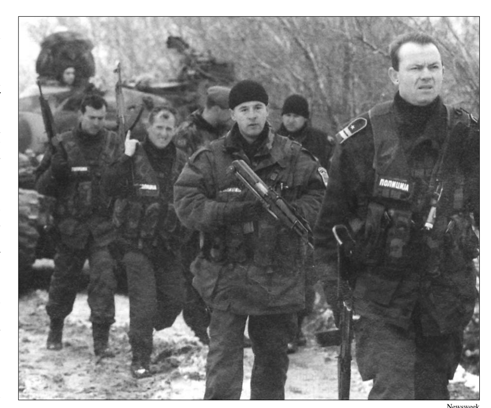
Serb forces advancing on the KLA in the Bukosh region of Kosovo.

Other cases are on ethnic minority groups. The reason is not limited to religions, cultures and human races. As globalization get into the center of world, it urged small groups to dissolve the minority race, leading people to recognize the importance of nationalism and identity. In other words, the root of these problems between integration and dissolution is from economic condition. So their situation is more serious than