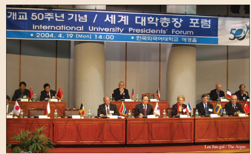
Presidents from HUFS' sister universities are giving speeches.

Delegates introduced their specialized programs and debated a so-called "Education without borders in the era of globalization," focusing on the multilateral exchanges and dynamic relationships.