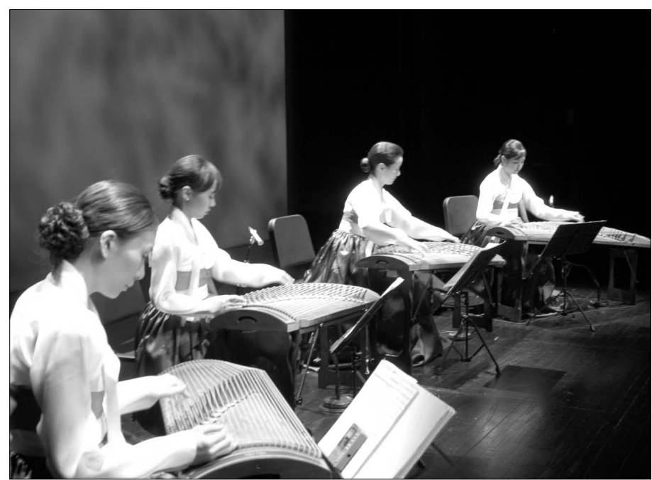
Sagye Ensemble members are playing kayagums with 25 strings.