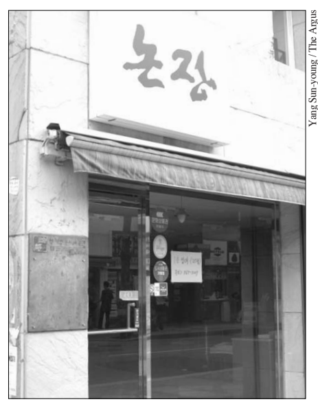
Nonjang, the bookstore which closed up the shop on February 16.